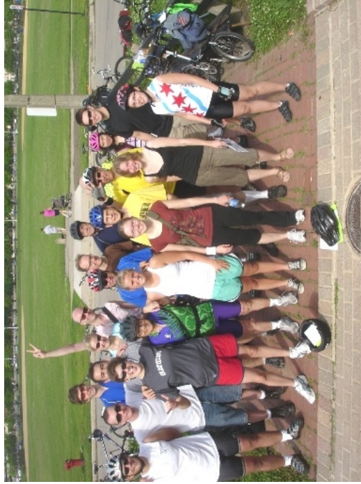
Green Riders at the Clocktower, June 7, 2008