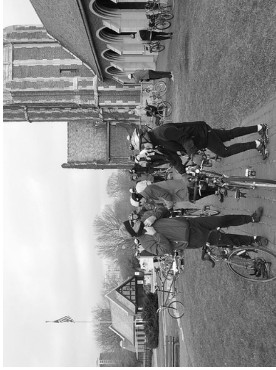
Riders on the Weather Be Damned Ride New Year's Day

THE NEWSLETTER OF THE CHICAGO CYCLING CLUB DERAILLEUR MAILLEUR December 2008