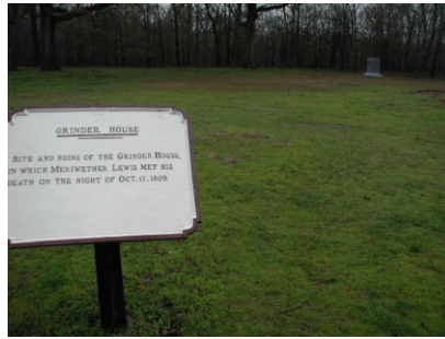
Grinder House plaque at the Lewis Monument