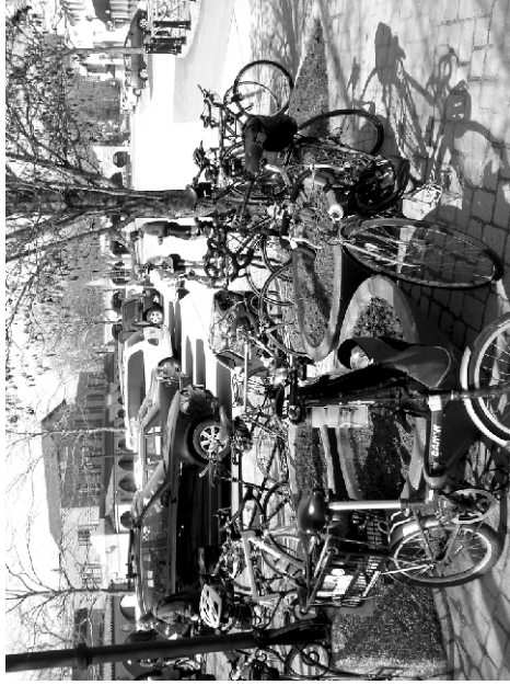
Only 2 months until ride season...