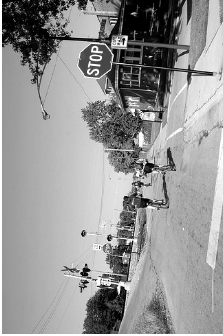
The BLT Metric Century Takes Riders to the Far South Side, September 2008