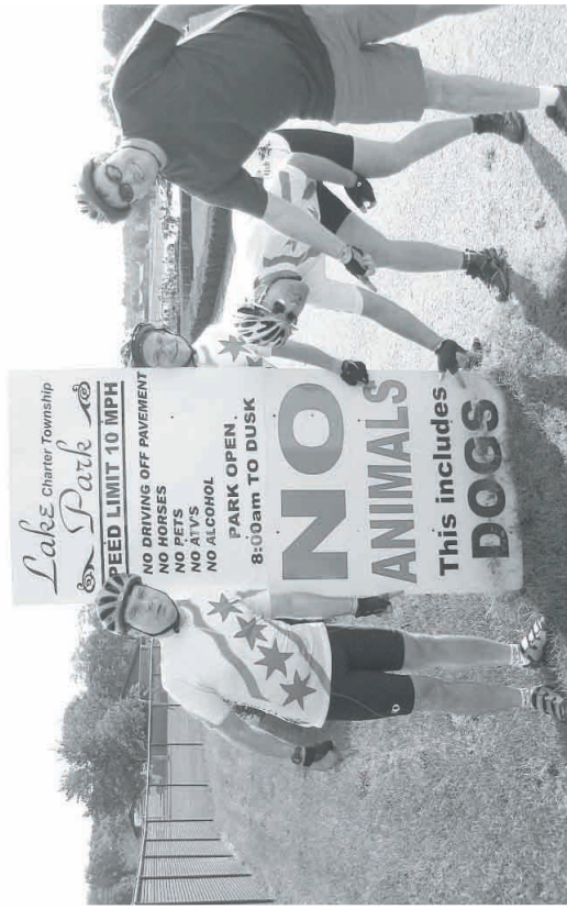
CCC Members explore exotic lands on the Apple Cider Century

THE NEWSLETTER OF THE CHICAGO CYCLING CLUB