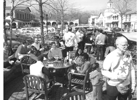
Plaza Del Lago